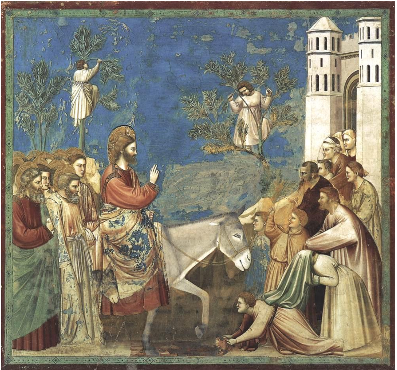
Entry into Jerusalem, Giotto, 14th century